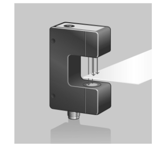
Fig.1: Functional principle

The switched outputs are set in dependence of the coverage degree.